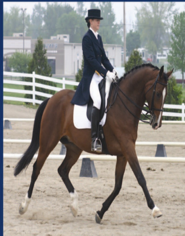
Ventura, started in 2002 by La Riata Ranch Champion FEI 5-year-old 2004 WBFSH Selection Trials, Competed YH Championships 2004