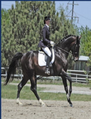
Der Graf, RPSI Stallion Donnerhall x Pik König Trained by LRR and standing at La Riata Ranch