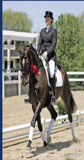
Bijoux, started fall of 2007 by La Riata Ranch. Reserve Champion FEI 6-year-old WBFSH Selection Trials. Selected for Young Horse Championship 2009.