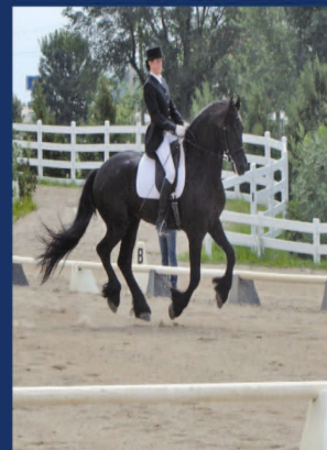
Maraus, 5-year-old Friesian stallion. Trained by La Riata Ranch. Training level champion at his first show out.

Call us at 712-778-5295 (Barn) or 402-598-7475 (Cell) or Visit us at www.lariataranch.com